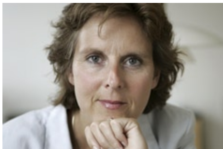
CONNIE HEDEGAARD MINISTER FOR CLIMATE AND ENERGY

“We must move the world from an era of talk to an era of change”